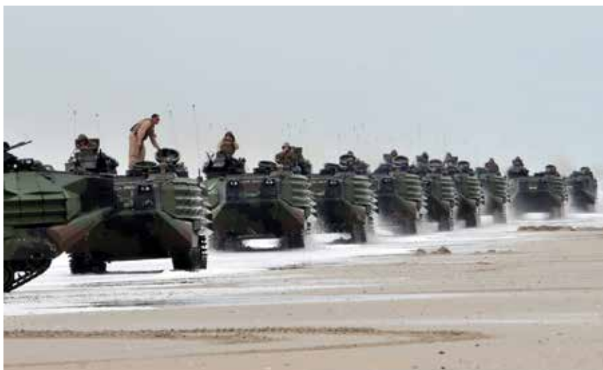
As part of its Pivot to Asia, the US has been rotating substantial amounts of military equipment into the region. Depicted are US Marine Corps amphibious assault vehicles moving into position during the amphibious assault phase of Exercise Bold Alligator 2012.

ric, Trump has also declared war on Germany. The fact that the US President openly questions the international involvement of the United States in NATO, for example, raises serious concerns that Western power arithmetic could change fundamentally.